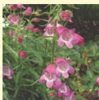
Pestemon Red Rockets

A multitude of perennial plant species have adapted to dry conditions for centuries. Extensive root systems allow these plants to seek and often store water deep beneath the soil surface. Xeric (low-water) plants often have finely divided leaves that create less exposure to the drying rays of the sun. The leaves are often covered with tiny hairs that reflect solar rays. Plants with these adaptations simply perform better, require less maintenance, and look healthier in times of drought.